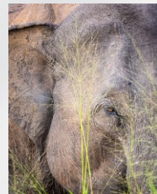
"Grass as High as the Elephant's Eye" Laurence Osborne