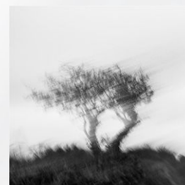
"Wind-Sculpted Tree (ICM)" Deb Ramsay-Trease LRPS